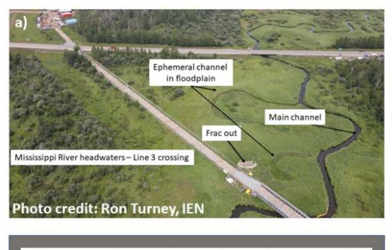
Figure 2. a) Top photo shows location of first known frac out at Mississippi River Crossing #1, observed by water protectors in a wetland on July 20, 2021. b) Right photo shows Enbridge workers attempting to clean up drilling fluid spill in the same wetland.